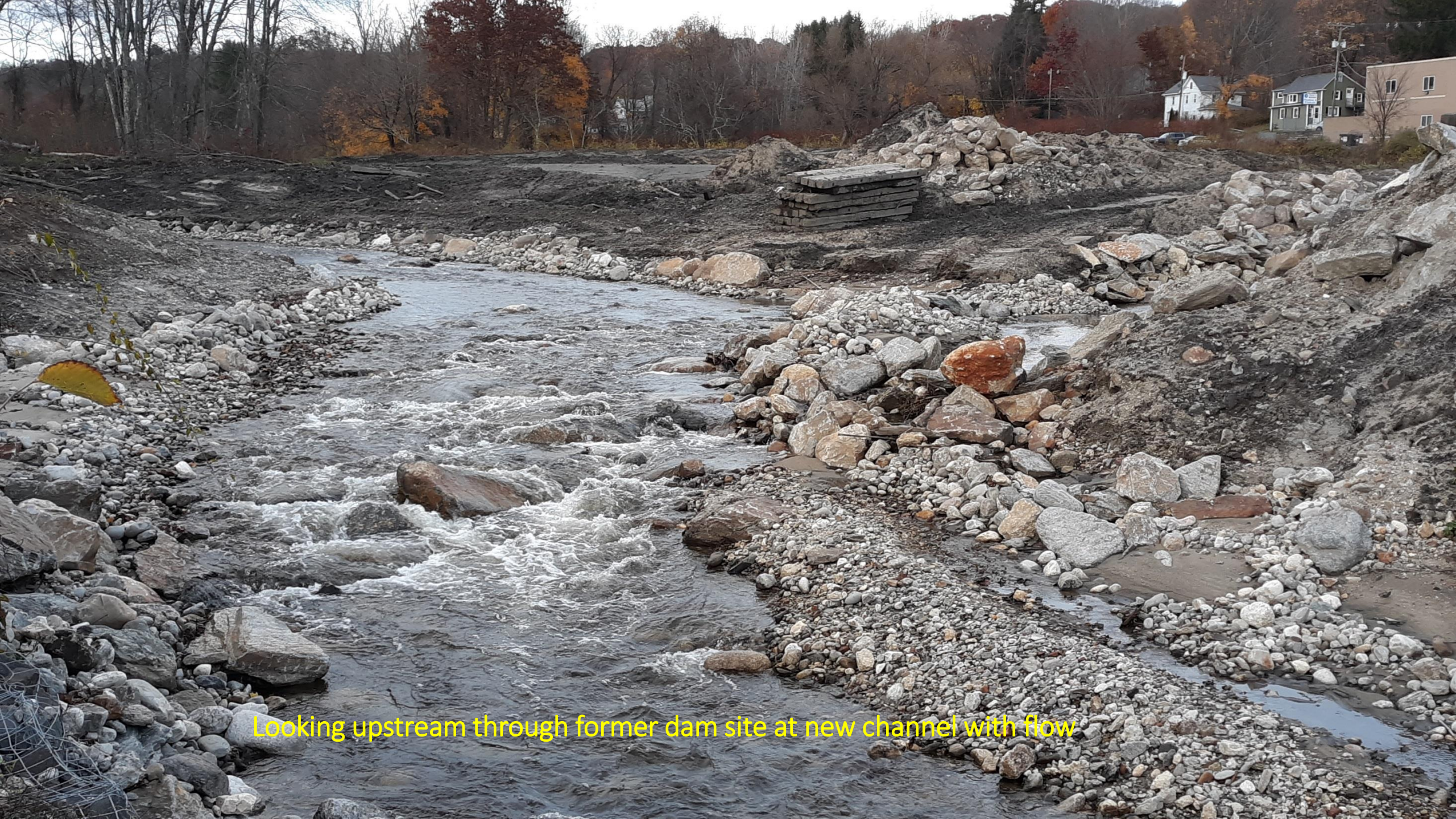
Looking upstream through former dam site at new channel with flow