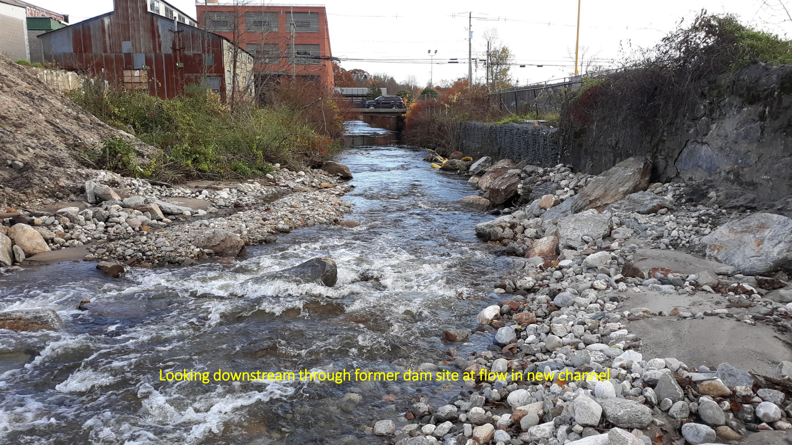
Looking downstream through former dam site at flow in new channel