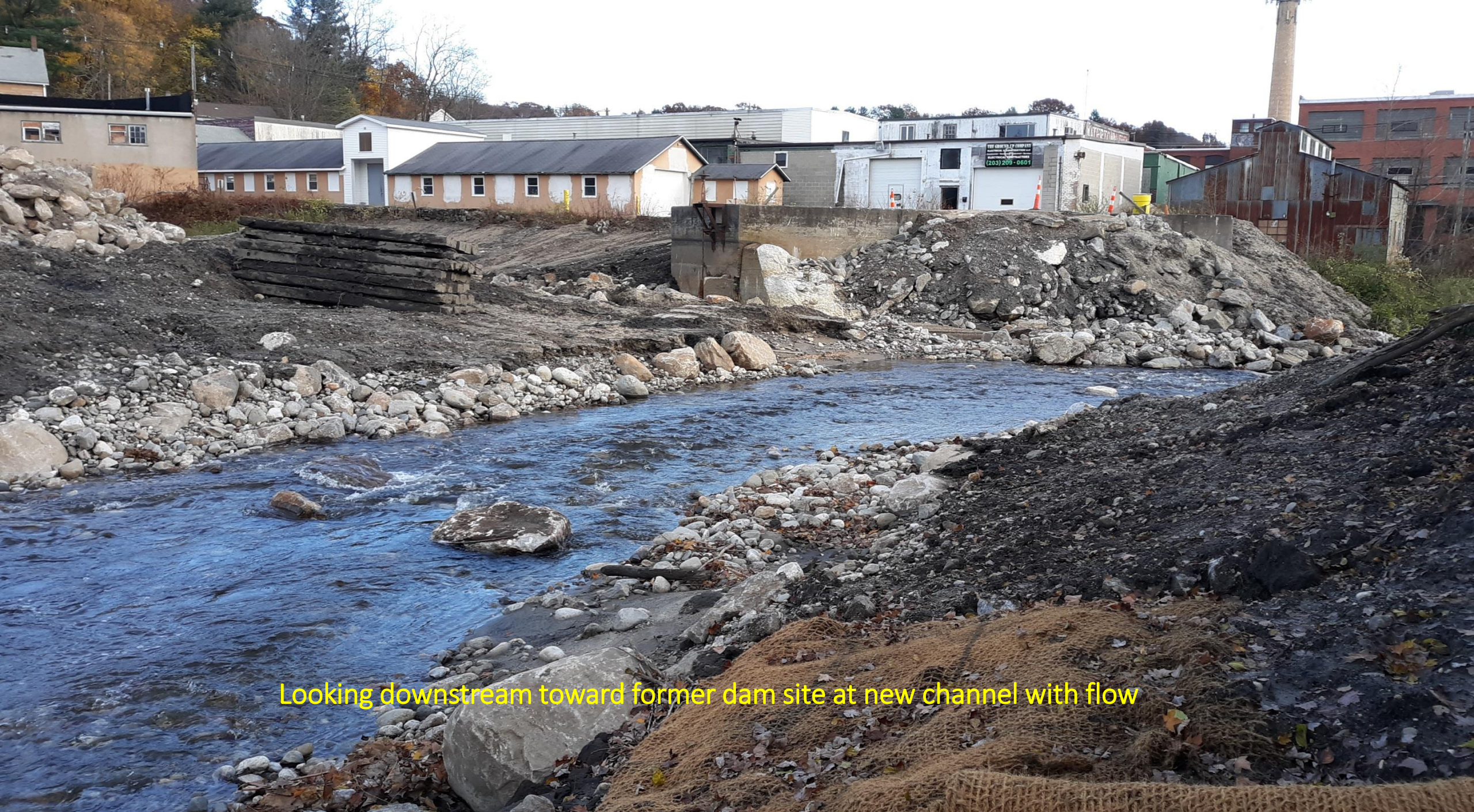
Looking downstream toward former dam site at new channel with flow