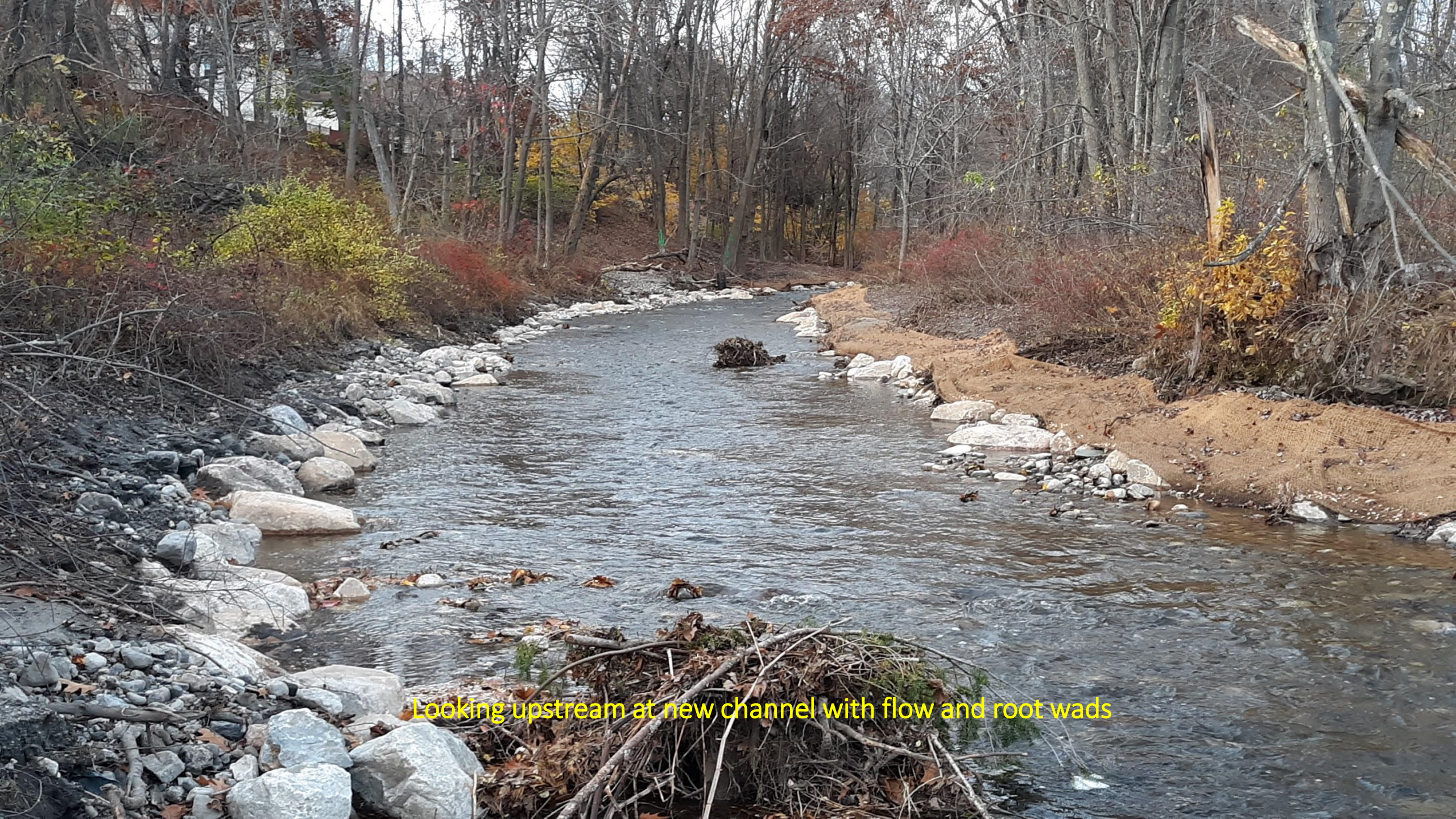
Looking upstream at new channel with flow and root wads