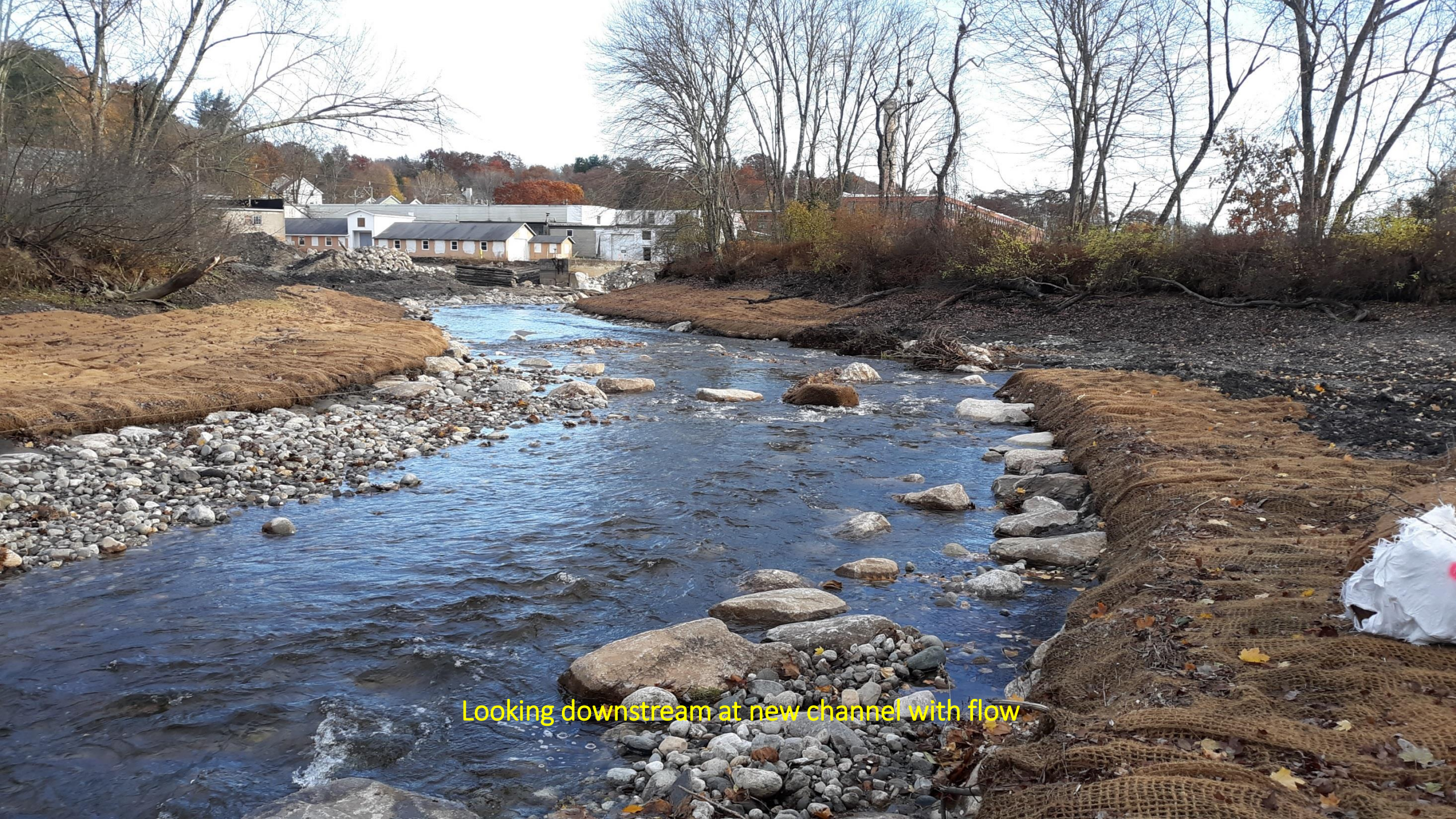
Looking downstream at new channel with flow