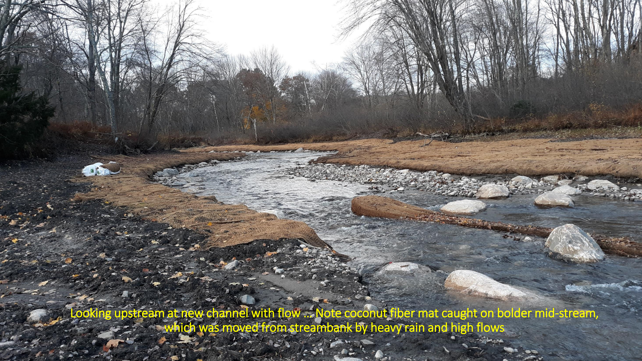
Looking upstream at new channel with flow ... Note coconut fiber mat caught on bolder mid-stream, which was moved from streambank by heavy rain and high flows