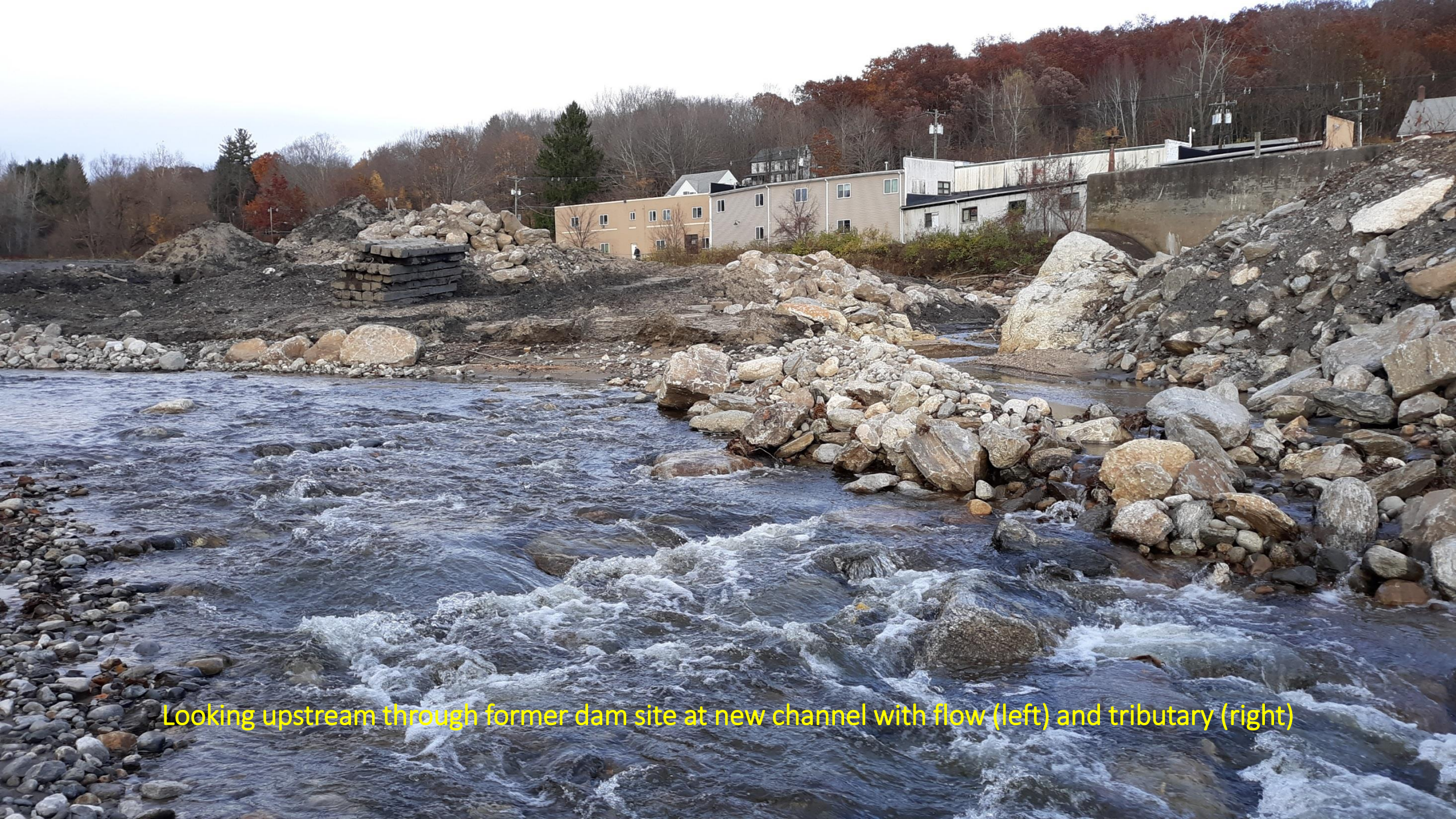
Looking upstream through former dam site at new channel with flow (left) and tributary (right)