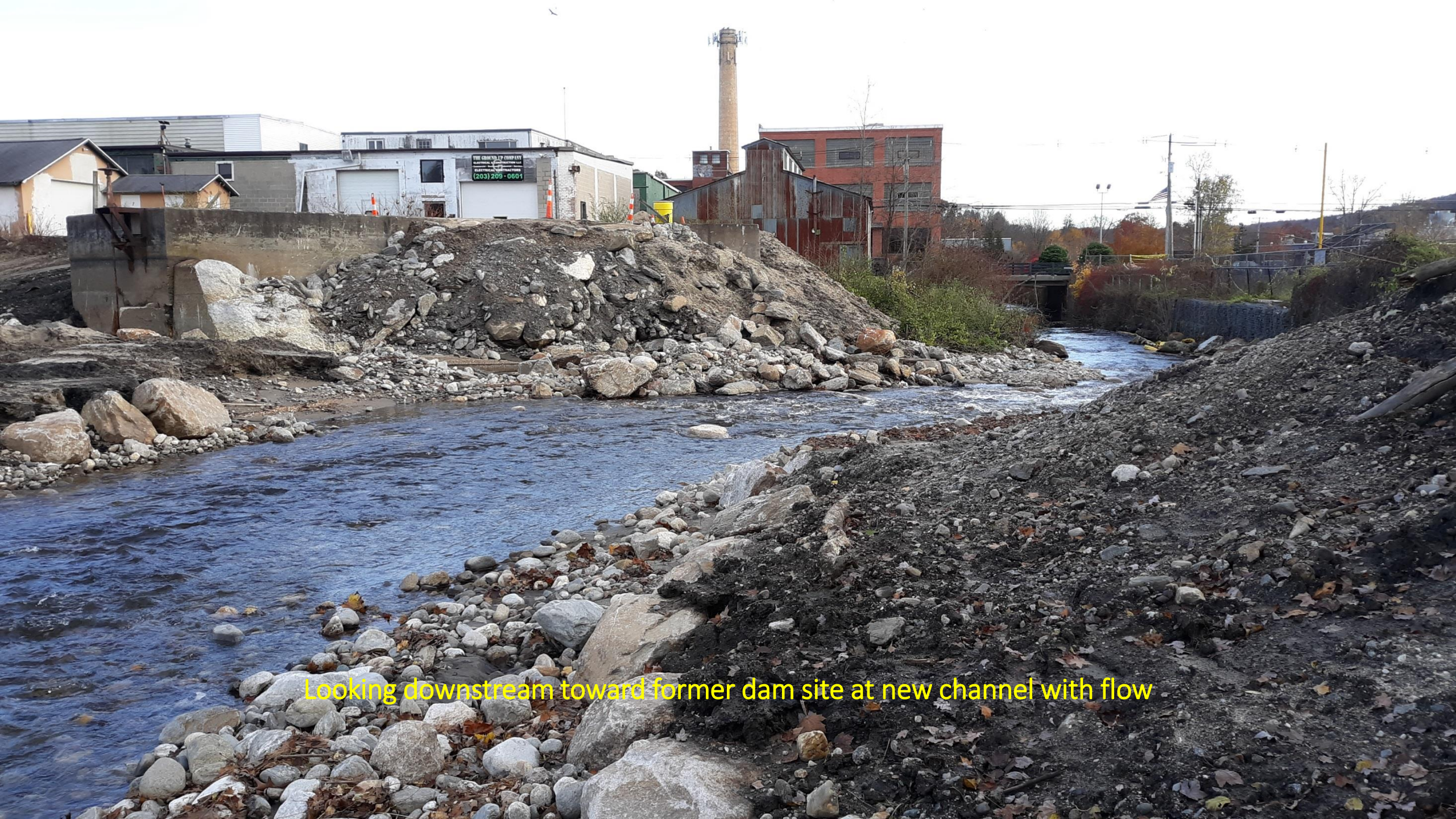
Looking downstream toward former dam site at new channel with flow