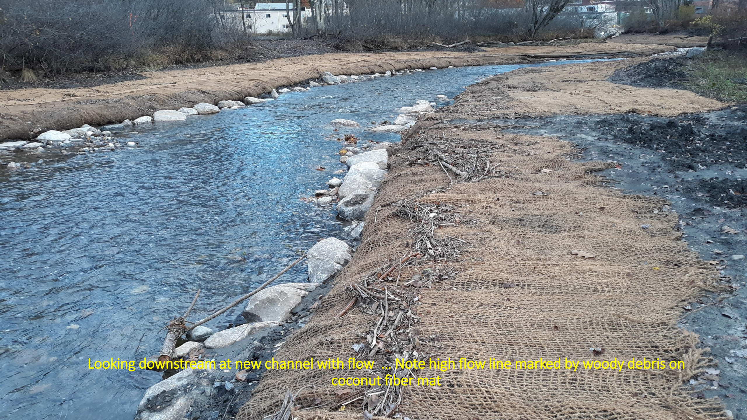
Looking downstream at new channel with flow ... Note high flow line marked by woody debris on coconut fiber mat