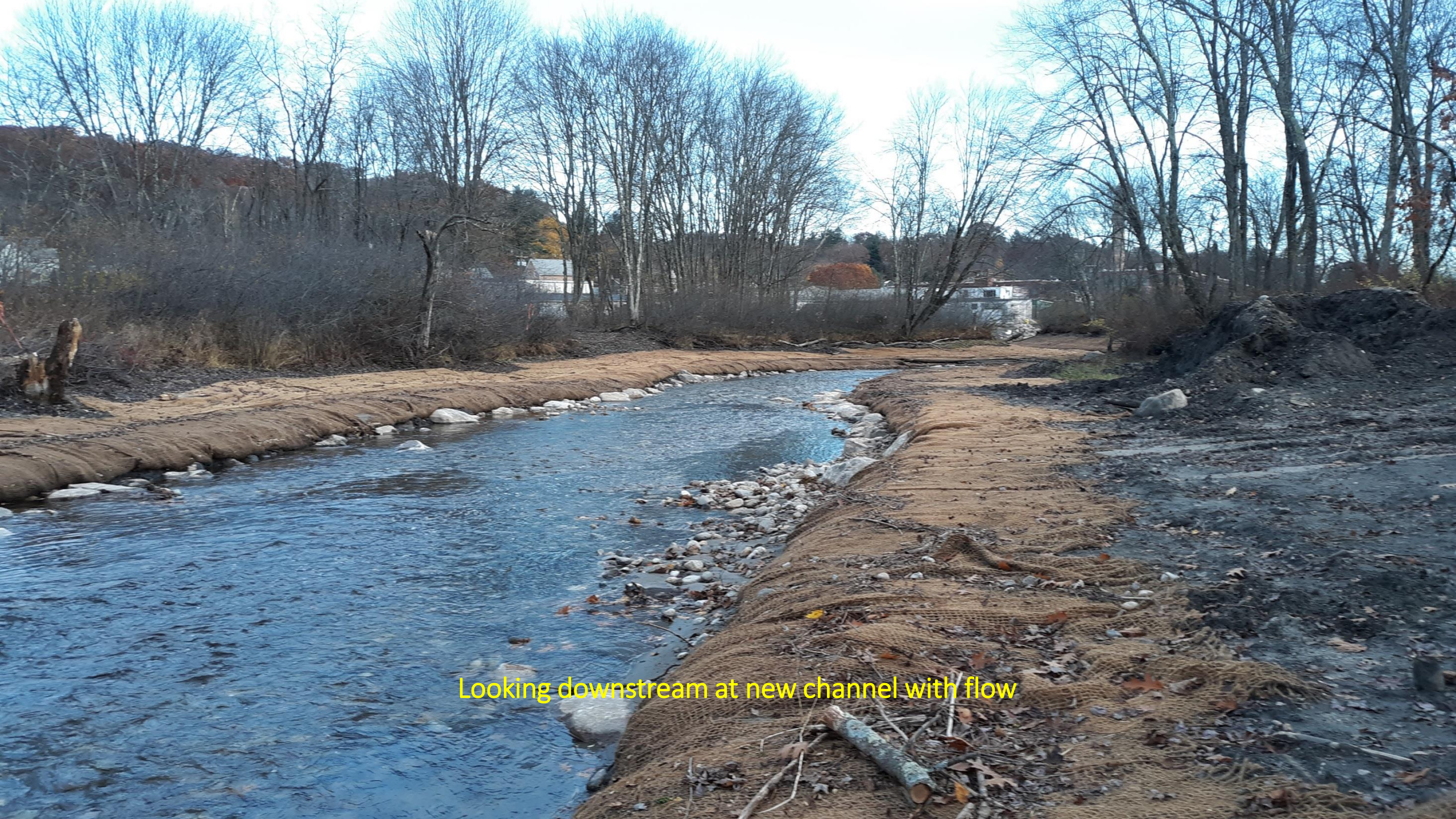
Looking downstream at new channel with flow