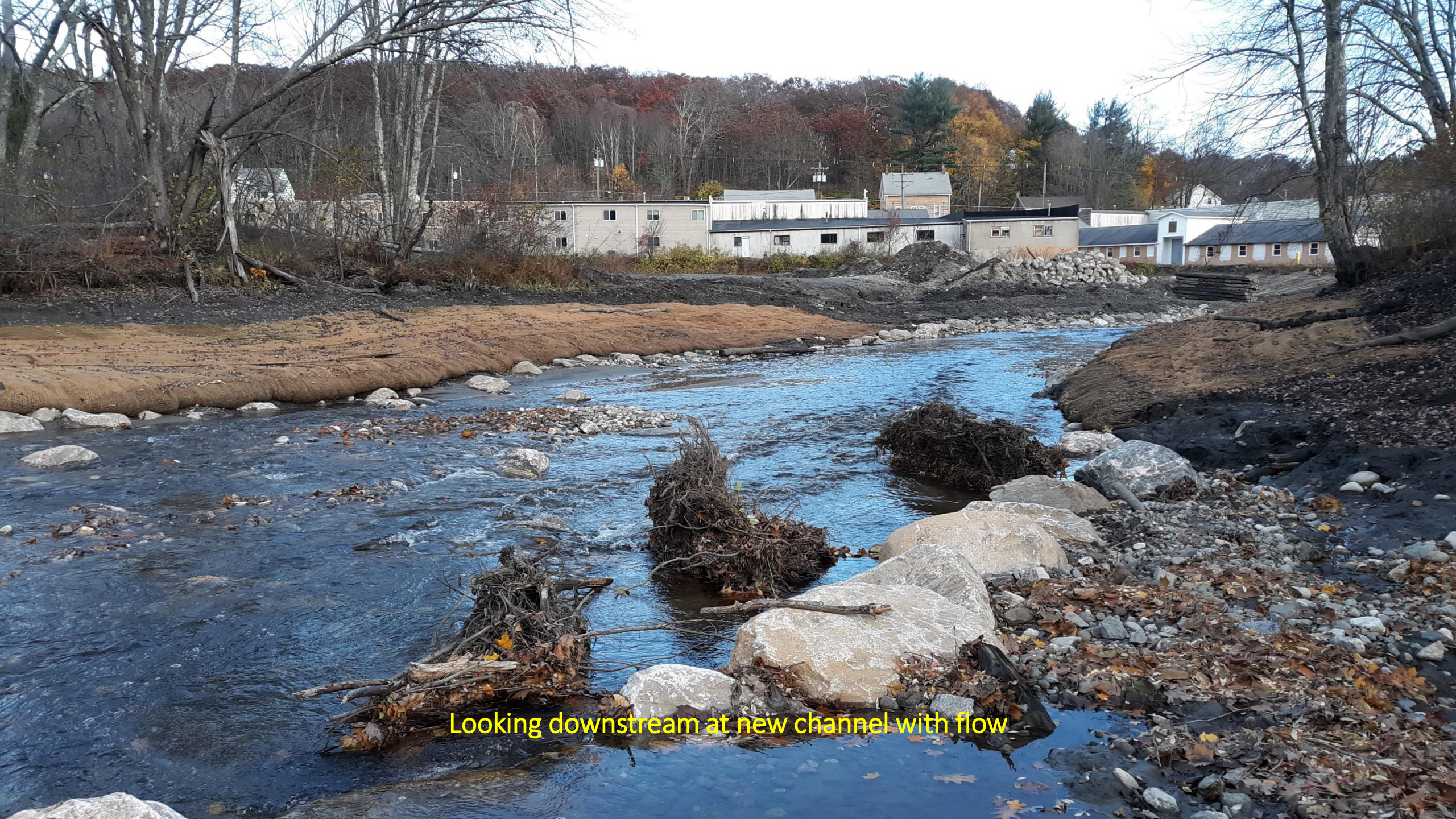
Looking downstream at new channel with flow