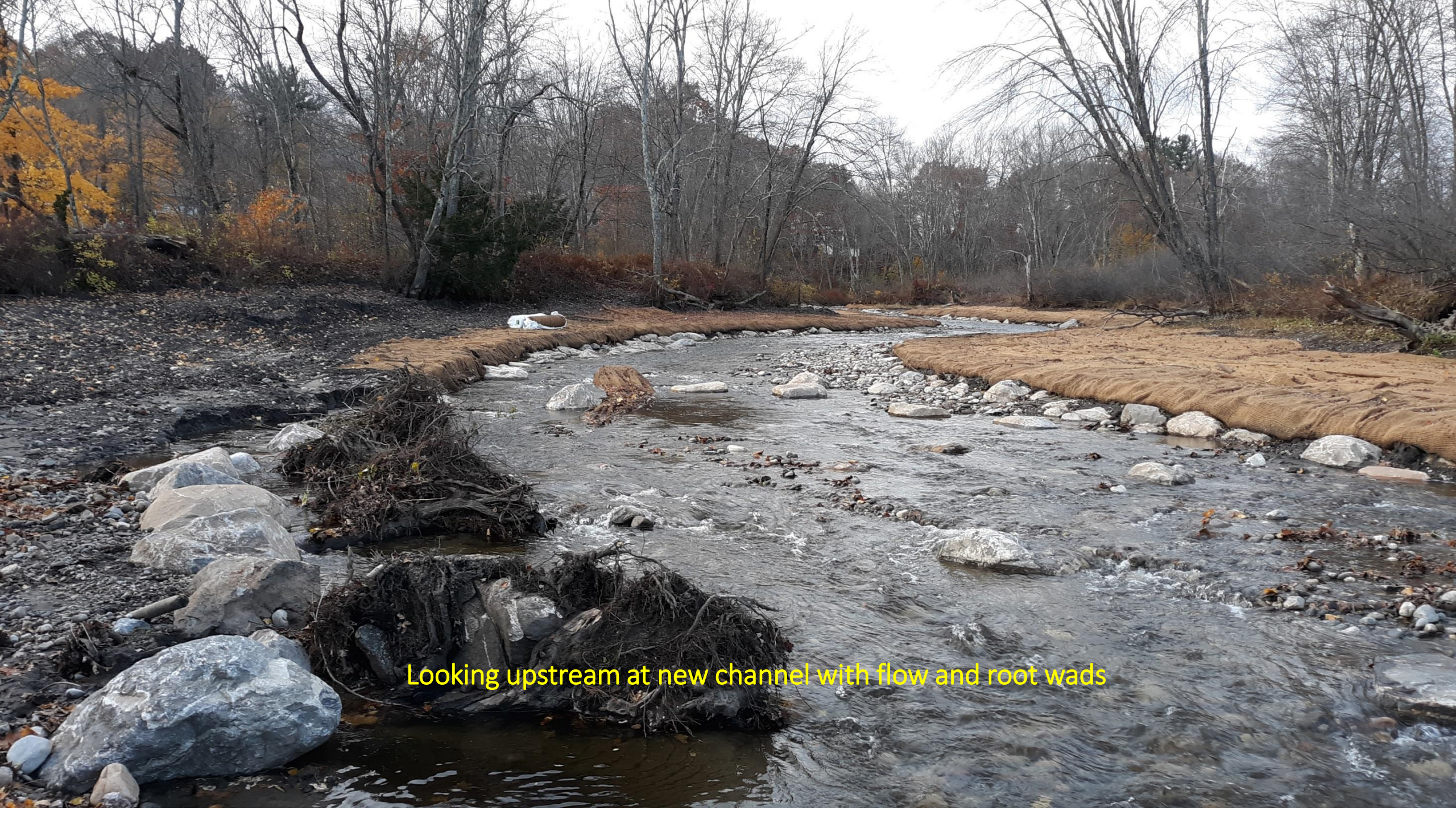
Looking upstream at new channel with flow and root wads