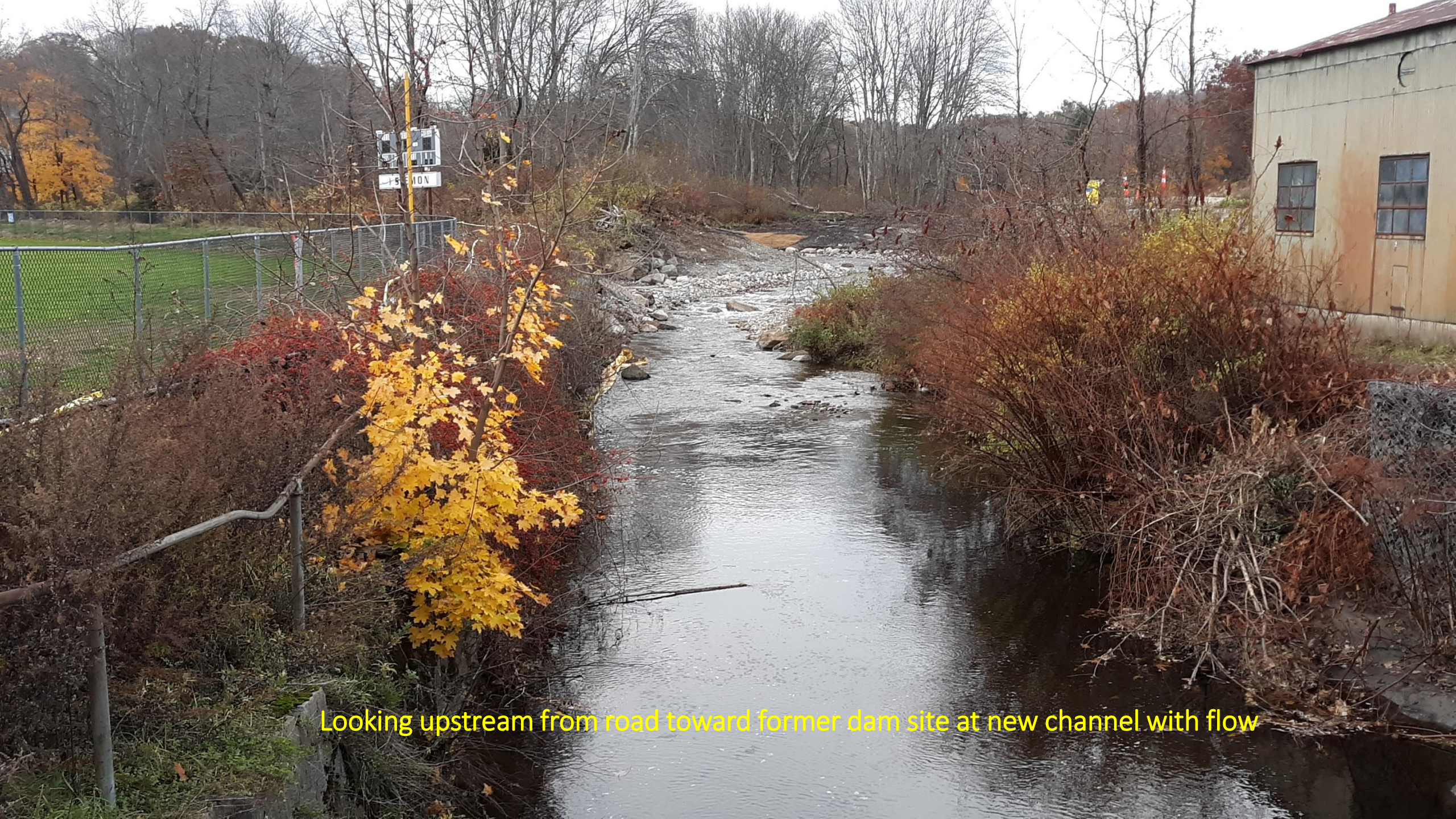
Looking upstream from road toward former dam site at new channel with flow