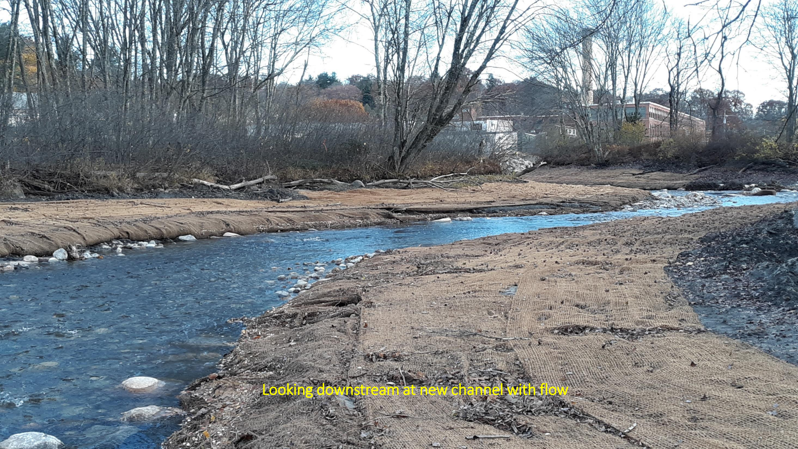
Looking downstream at new channel with flow